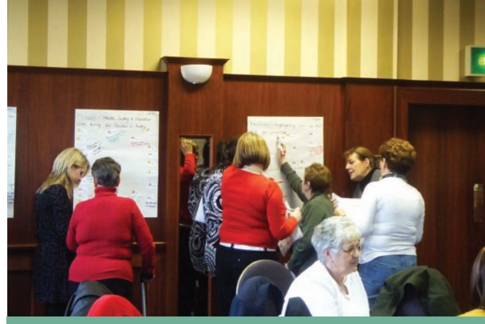
Session 1 workshop

At the same time as many women were trying to steer their offspring away from the conflict, many also recalled trying to "shield children from things that were happening". This was an experience common to women from rural and urban, and Protestant and Catholic backgrounds. For some, this meant avoiding the truth in conversations with their children. One woman from a Protestant group recalled: "trying to hide the truth from the kids about what was happening when vans / cars and granny's house got burnt out". Another said: "I kept my children in the dark – made up my own reasons for the events that happened – they were not yet teenagers". For many women, this was about protecting their children from frightening details, and for others, it was a matter of security. Women married to members of the security forces recalled telling their children not to discuss their father's job outside the home. One woman remembered "explaining to children without saying too much about their uncle and what he was involved in – hoping they would not tell all at school or to someone you didn't want them to for example at the shop". Other women said little to their children in the hope of "letting them form their own opinions". One woman had sent her son away to be educated, believing he would be safer away from home.