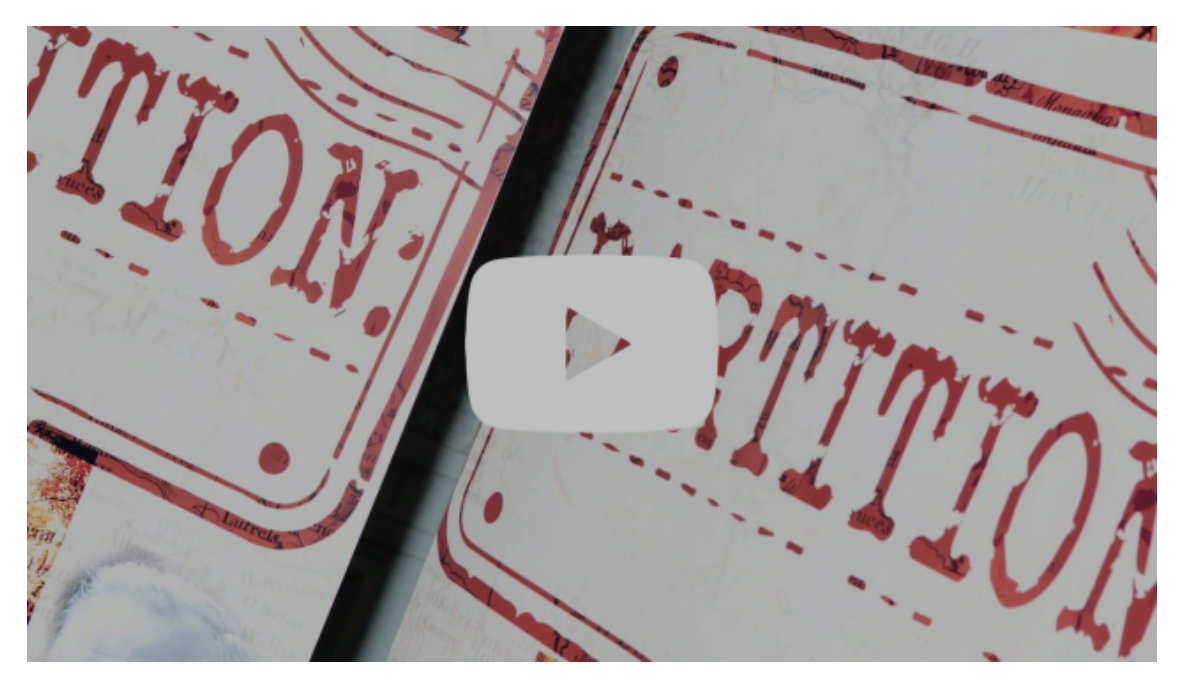
The Community Relations Council, Heritage Fund and Decade of Commemorations Roundtable organised a regional one-day event about the period 1920-22.

The theme of partition was also continued in another Decade of Centenaries roundtable held on 27 February 2020 in Crumlin Road Gaol.