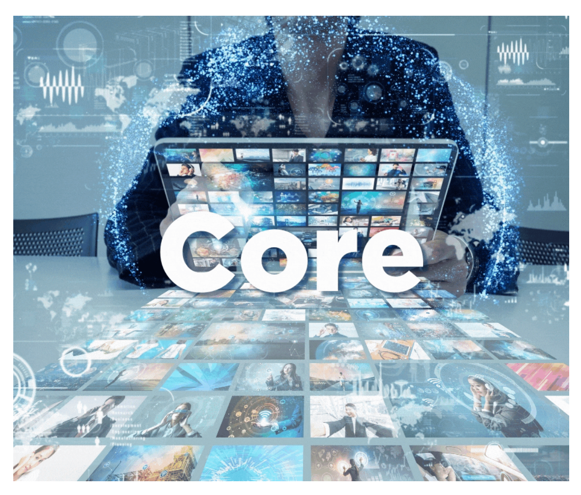
Core Funding Scheme