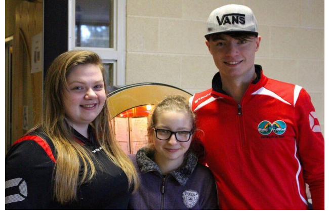
Uniting Erne East Young Leaders with workshop participant

"We are helping to make a difference to the community and providing skills for young people"