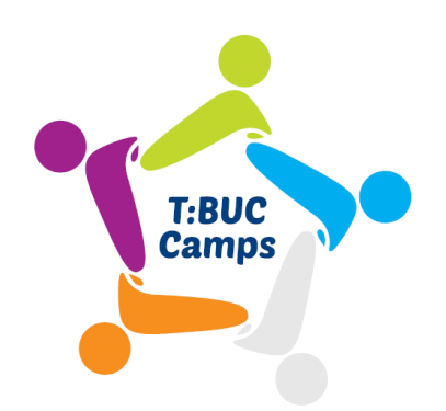
Junior Minister Alastair Ross attended an evening at "R" City Belfast where the young people showcased the work of the T:BUC camps.