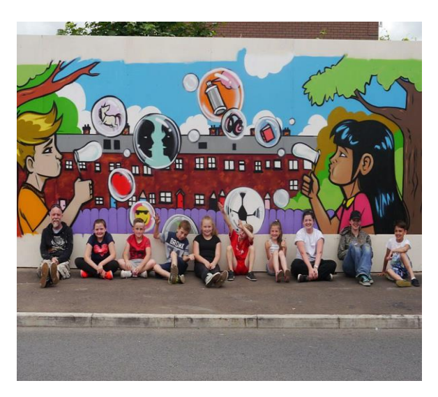
Mural at the entrance to Ballynafoy Close, pictured are the artists and the young that helped to design the mural.