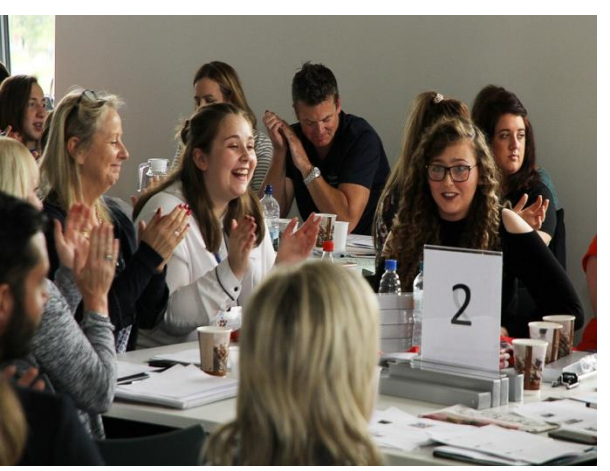
Participants at the Engagement Forum in Dungannon