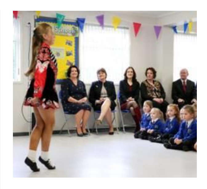
The First Minister and deputy First Minister along with the NI Secretary of State visit Phoenix Integrated Primary School

The Minister of Education announced a third call for applications to the programme on 20 September 2016, with the next projects expected to be announced soon. Work continues on the five campuses that have already been announced, with the Limavady and Ballycastle projects being at early design stage.