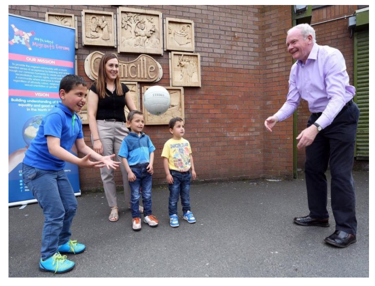
The deputy First Minister and Junior Minister Fearon visiting Syrian Refugees.

In taking responsibility for vulnerable groups of people, our primary concern must be to ensure that their wellbeing is safeguarded and that we support them in building a new life. It is therefore important that their arrival and integration is managed and balanced with our ability to meet their needs.