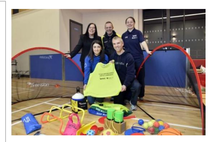
Above: Promoting Good Relations through Sports' kitbag programme