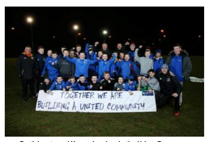
Participants and Young Leaders in the Urban Programme