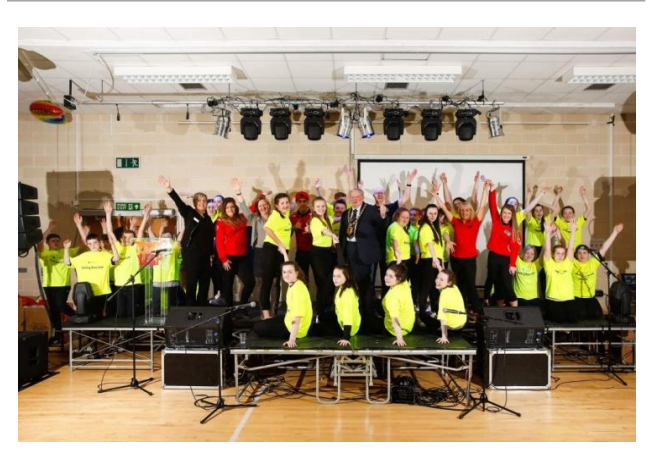
Uniting Erne East Celebration Event

In partnership with the TEO Urban Villages team, engagement around recruitment of leaders within two of the Urban Village areas, Colin and Eastside is underway in advance of main programme delivery in 2017/18.