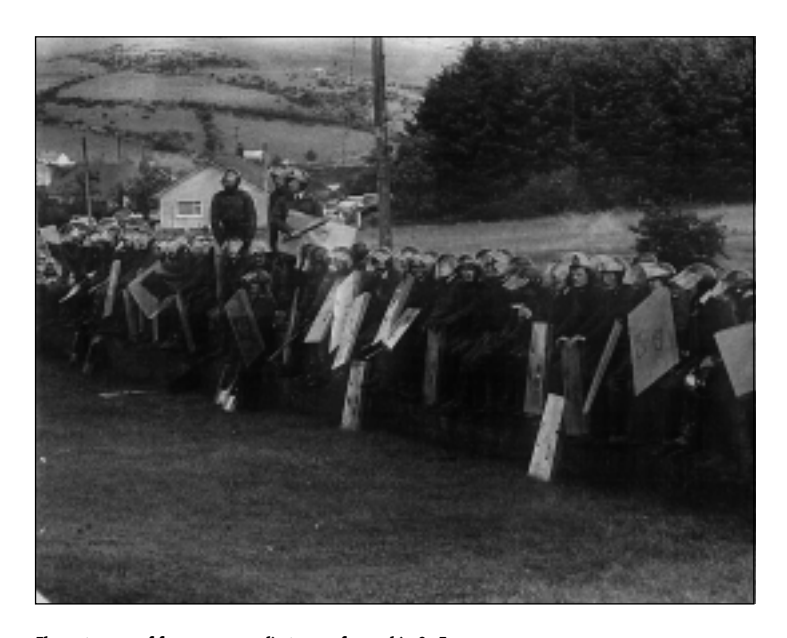
The argument of force—attending an IRA funeral in Co Tyrone

So, we are not even at the stage at which other countries had arrived when they established their truth commissions. Nor does it follow that—if and when we did arrive at that point—a truth commission would magically solve all our