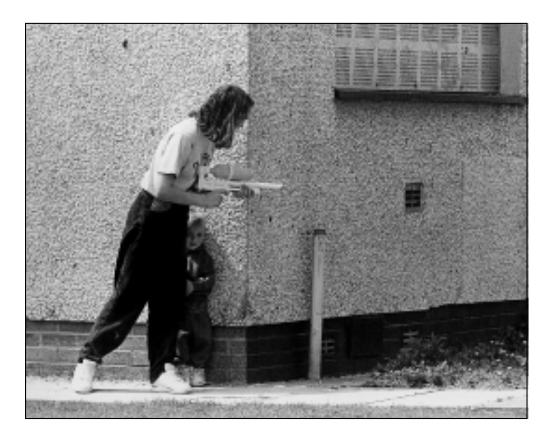
The effects are long-term

Evidence of effectiveness is a measure of performance. It is 'productive or capable of producing a result, actual rather than theoretical' (Collins English Dictionary, 1991). Evidence of effectiveness is a relatively new concept in Northern Ireland. It is evidence that interventions do what they say they do—that they are effective in achieving the aim of the intervention. This is not a new concept in most other professions and it seems to be the