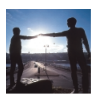
BUILDING PEACE SHAPING THE FUTURE

Address for correspondence: Ara Coeli, Armagh BT61 7QY