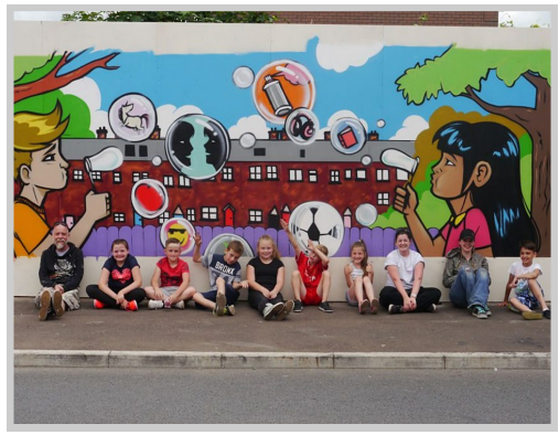
Community Mural at Ballynafoy Close, Ravenhill Road

Great progress is being made on the Shared Neighbourhoods scheme.