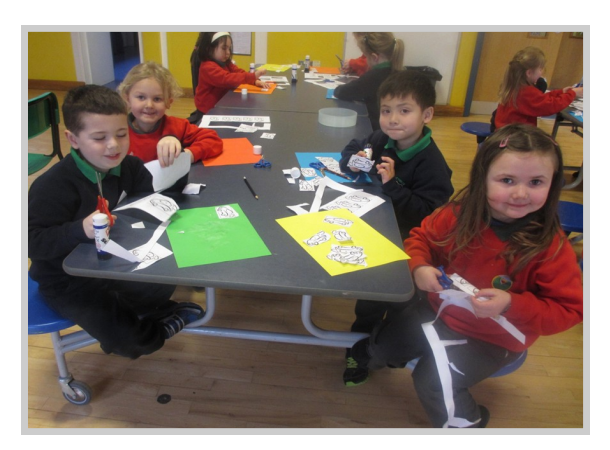
Shared Classes take place weekly

A third call for Shared Campus proposals opened on 20 September 2016 and closed on 27 January 2017. Information sessions were held in Omagh & Belfast for interested schools. Eight applications have been received involving more than thirty schools. Successful projects are expected to be announced in May 2017.