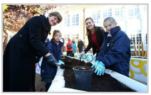
Blythefield Primary School garden opening in November 2016