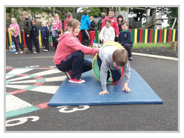
Joint Fun Sports Day

A great example of partnership working already taking place is with Duneane and Moneynick Partners in Learning, who were selected from the second call. They have developed a shared logo, created as the result of a competition. They invited pupils from both schools to design something that reflected the joint activities of their Partnership. They use it on all communication including the shared parents' updates, shared newsletter and shared Facebook page as well as at joint public events.