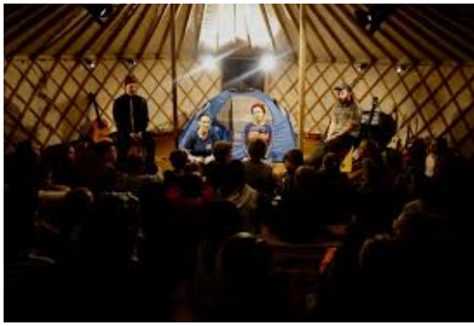
March in Fane Street Primary School. The programme is funded by CRC.